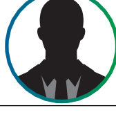
TBC Australian Association of Practice Management (AAPM)